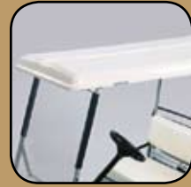
Canopy Top White and Beige