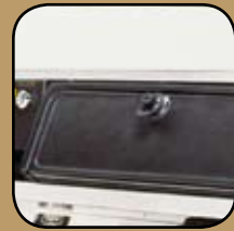
Glove Box With Lock