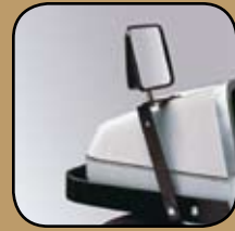
West Coast Mirror/ Heavy-Duty Bumper