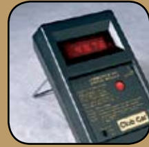
Communication Display Module