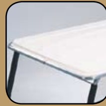
Canopy Top White and Beige