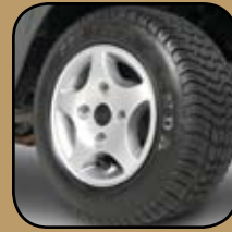
10-Inch Aluminum Alloy Wheels