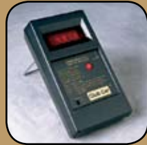
Communication Display Module

*Headlights, Taillights, Brakelights and Horn