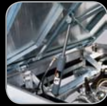
Electric Bed Lift