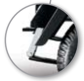
Smooth, independent front and semi-independent rear suspension