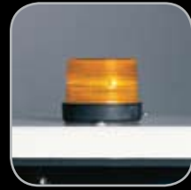
Safety Strobe Light