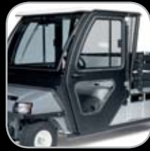
Certified ROPS Cab Enclosure