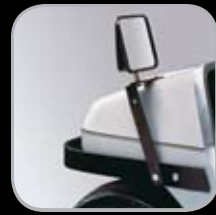
Heavy-Duty Bumper/ West Coast Mirror