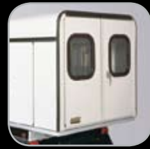
Custom Van Box