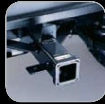
2-Inch Rear Receiver Hitch