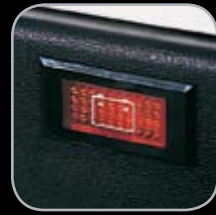
Battery Capacity Indicator