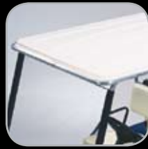
Canopy Top White