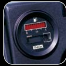
Fuel Gauge and Hour Meter