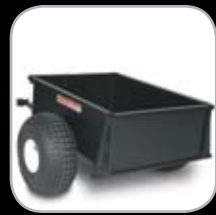
Swisher Dump Cart