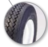
6-ply, premium tread front/extra-traction tread rear tires